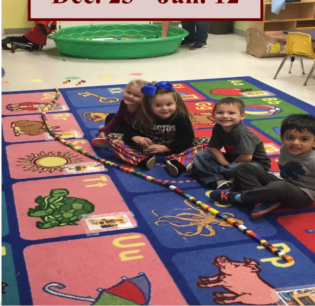
Little Lambs working on Counting Cubes

Early Release at noon Friday, December 20th. Return Jan. 13th.